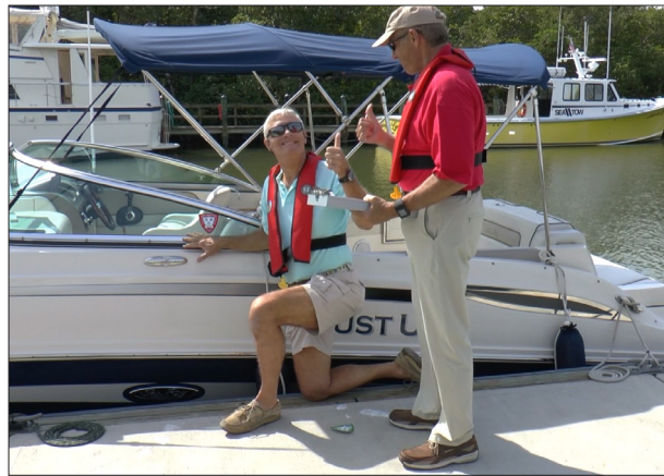
Another successful VSC experience