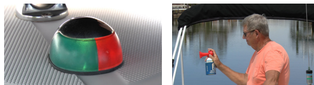
For more videos, see: americasboatingchannel.com